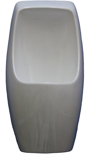
Menos ™ II